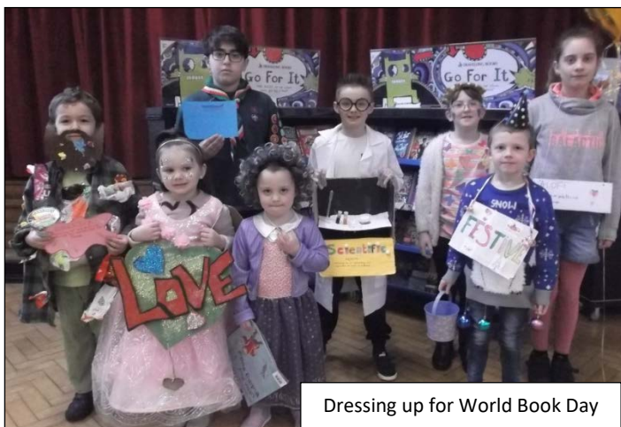
Dressing up for World Book Day