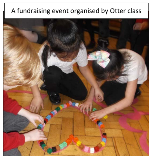
A fundraising event organised by Otter class