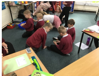
Practical Maths: Year 3