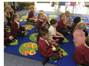
Story time: Reception