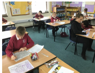
Non fiction writing: Year 4