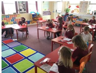
Spellings: Year 1