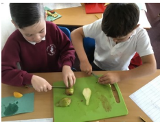
Chopping skills in DT: Year 2