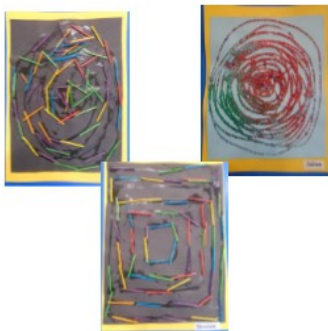
Reception - Alma Thomas' Expressionist Art Painting