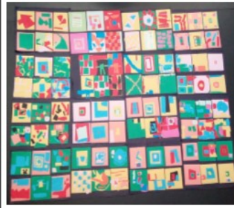
Year 2 - Face Masks inspired by Lois Mailou Jones