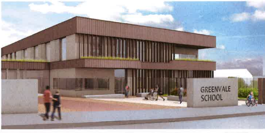
Visual of the new school - indicative only, colours are to be confirmed

This is the Greenvale School expansion newsletter keeping students, parents and staff updated with the latest project developments. We would like to thank you for your ongoing cooperation and valuable feedback.