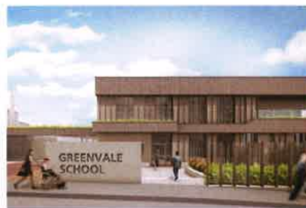
Visual of the proposed building