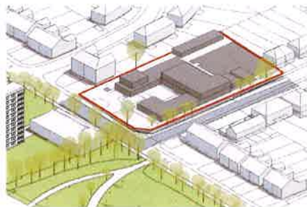
Visual of the former building

Headteacher and staff offices will be located close to Mayow Road. This has been designed to better safeguard our pupils as staff will be able to clearly observe the drop off and pick up points from their offices.