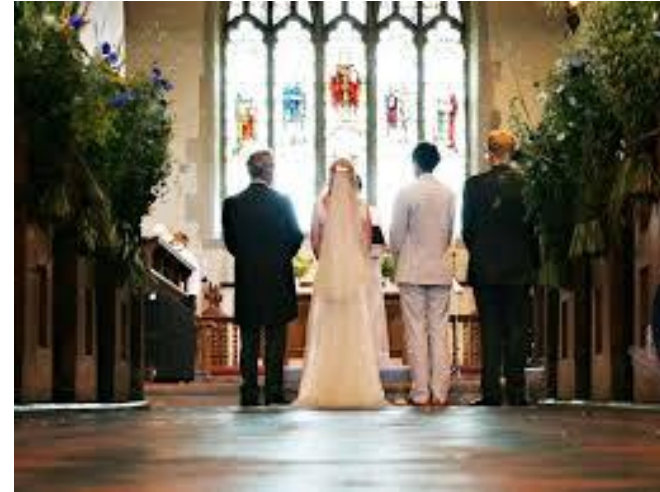
A Christian wedding in a church