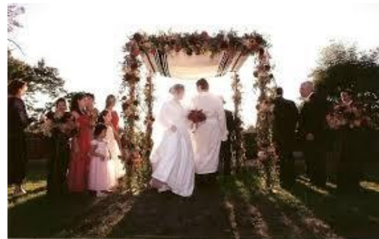
A Jewish wedding under a special canopy called a chupa