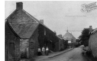
Dobwalls Village (1906)