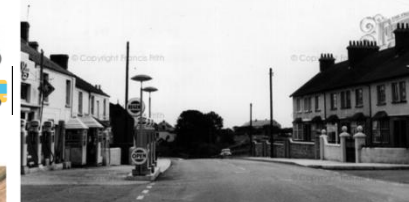
Dobwalls Main Road (1965)