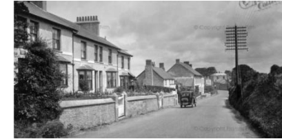
Dobwalls Village (1931)