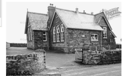
Dobwalls School (1965)