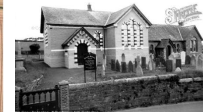
Methodist Church (1965)