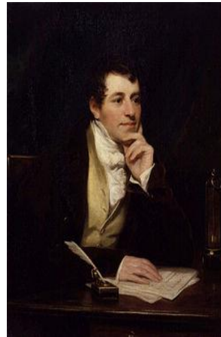
Humphrey Davy Inventor 1778-1829