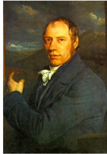
Richard Trevithick Mining Engineer 1771-1833