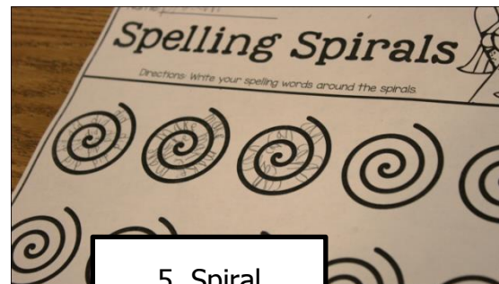
5. Spiral Spelling

rad-ish ra-dar nev-er fe-ver driv-en dri-ver rob-in ro-bot un-fit u-nit