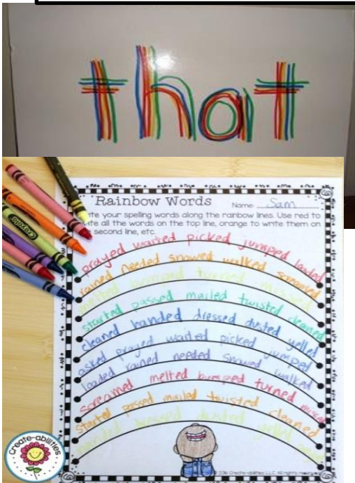
4. Rainbow Writing