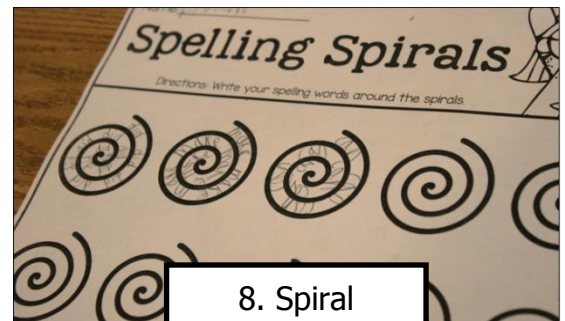
8. Spiral Spelling