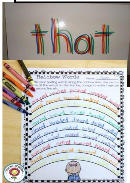
7. Rainbow Writing