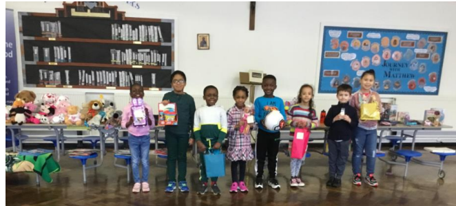
Some of our Year 2 children with their raffle prizes.

We have been so pleased with how hard all the children in school have worked to earn raffle tickets during Advent. They truly have been living out our virtues, following the Gospel and preparing their hearts for Jesus. Their happy faces were a joy to see when they had their names picked out of the raffle jars on Wednesday! Thank you to all staff who donated prizes for the children.