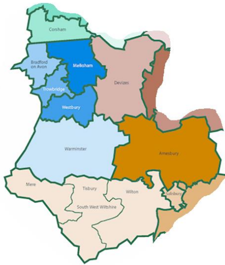
Warminster is a town north of Salisbury.