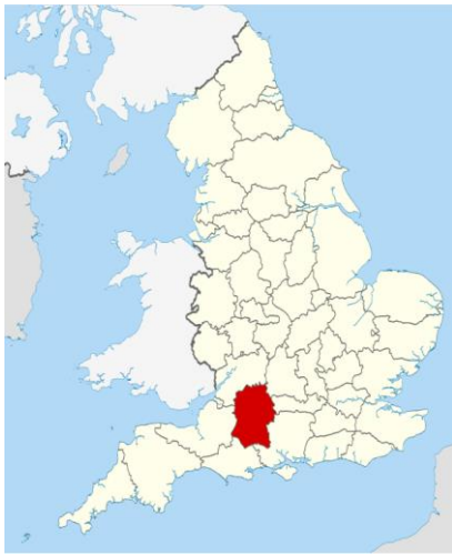
Warminster is in Wiltshire, which is in the South West of England.