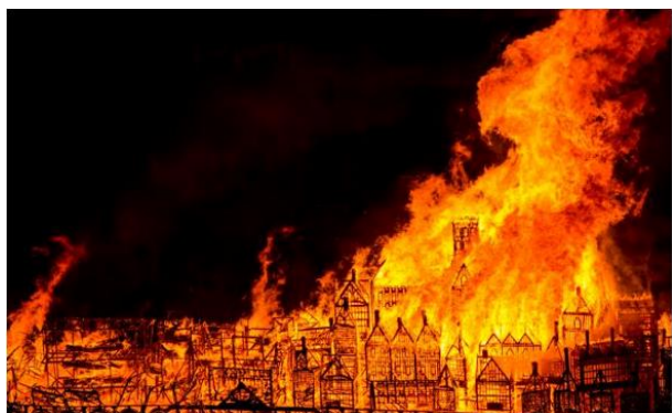
The Great Fire of London (timeline below)