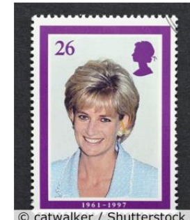
Princess Diana 1961–1997