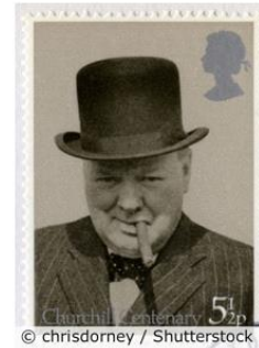
Winston Churchill 1874–1955