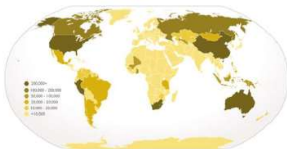
Oil Consumption by capita

This map shows where gold is mined and produced.