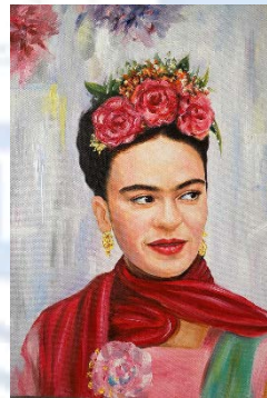
Artist focus- Frida Kahlo (self portraits)