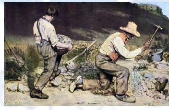
The Stone Breakers (1849)