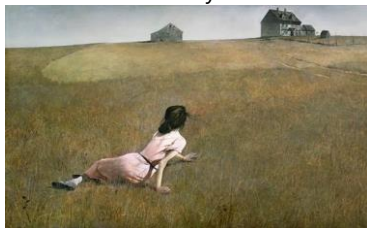
Christina's World (1948)