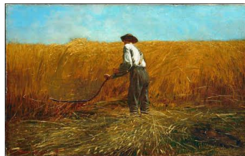
The Veteran In a New Field (1865)