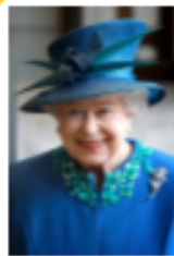
Queen Elizabeth II