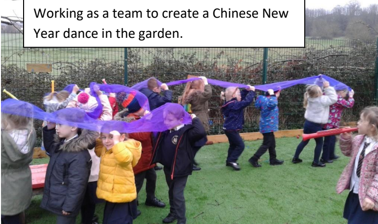
Working as a team to create a Chinese New Year dance in the garden.

Physical Education in the Early Years covers a number of objectives such as experimenting with different ways of moving, jumping off objects and landing appropriately, negotiating space successfully when playing chasing and racing games with other children by adjusting speed or changing direction to avoid obstacles, travelling with confidence and skill around, under, over and through balancing and climbing equipment, showing increasing control over an object in pushing, pulling, throwing, catching or kicking it.