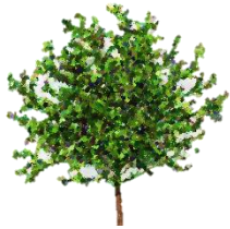
CRAB APPLE TREE