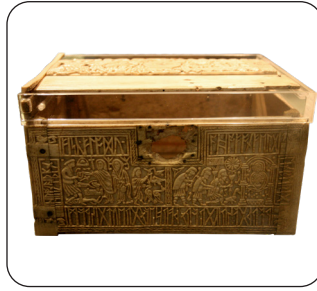
The Franks casket