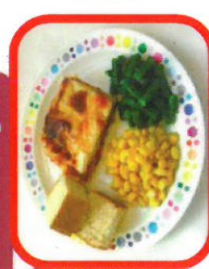
(vg) Veggie Hot Dog (G.SB.SU.)