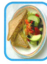
(v) Cheese Sandwich (D.G.SB.)