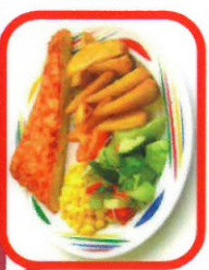
(v) Cheese and Tomato Pizza Wedge (D.G.)