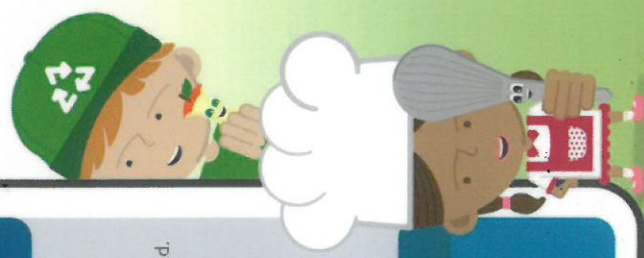
(v,h) Homemade Favourite Fruit Muffin (G.E.D.) (v) Ice Cream Tub (D.)

All our meals include a carbohydrate accompaniment, seasonal vegetables and/or salad. We offer a choice of fruit juice cordial, organic semi-skimmed milk and water to drink.