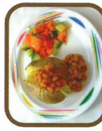
(v) Jacket Potato with Cheese and Beans (D.)