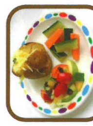
(v) Jacket Potato with Cheese (D.)