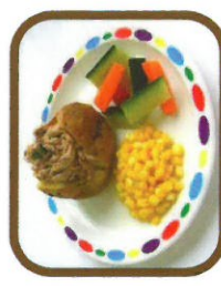
Jacket Potato with Tuna Mayonnaise (E.F.)