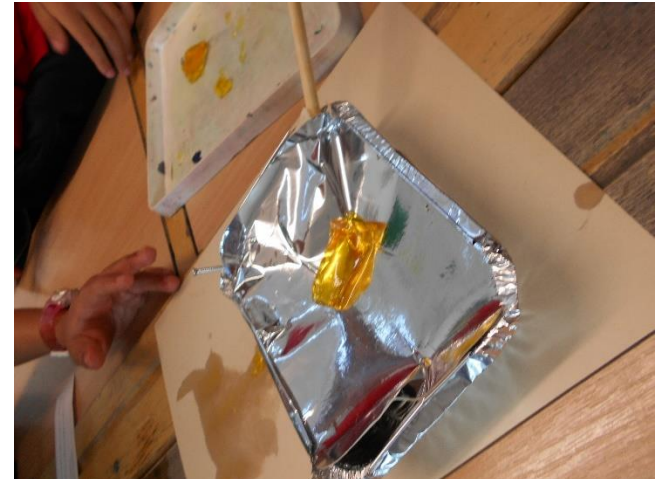
Year 5 tested the different properties of wood, iron and jelly in science this week.