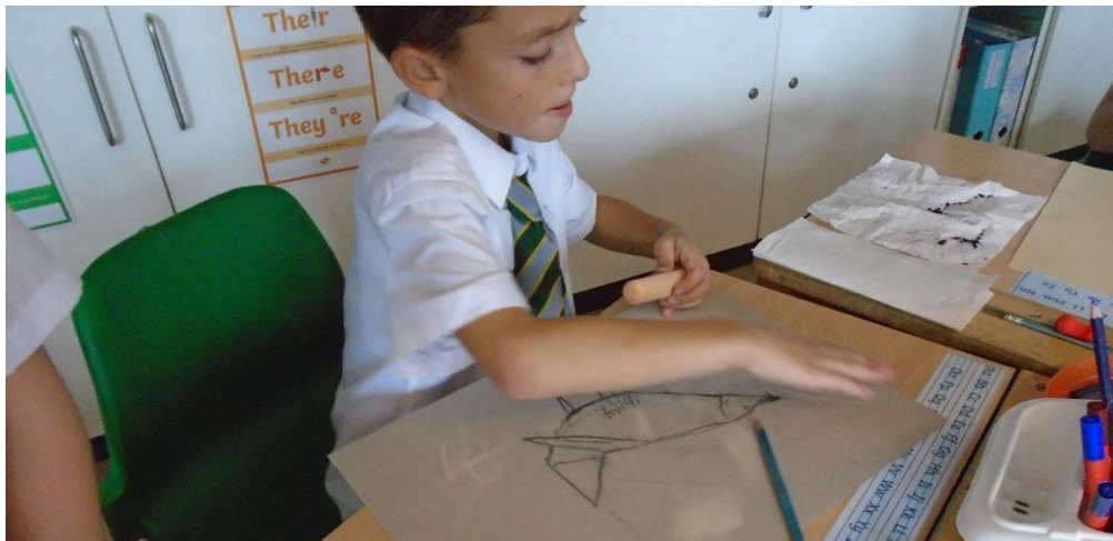
Year 3 designed prehistoric animals using shapes, charcoal and chalk during their art lesson.