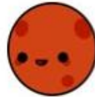
3:30-4mins: Magnificent Mars