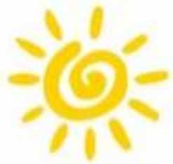
Under 2 mins: Super Sun

This week's personal best is the Solar System workout! For this challenge grab a ball to represent the sun, and 8 other balls (place in a pile in a corner of the room) to represent the planets. Put the sun ball in the middle of the room & then take several big steps back from it. Now you must run 3 laps around the sun! Once you complete three laps, grab the first planet (Mercury!) and place it next to the sun. Go again for another 3 laps and then grab the next planet & keep going until all the planets are by the sun! Time yourself & see how quick you can do it!