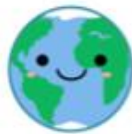
3-3:30 mins: Excellent Earth