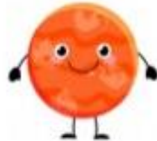
2:30-3 mins: Valiant Venus