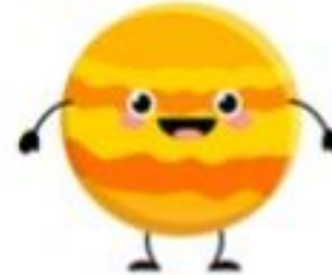
4-4:30 mins: Jubilant Jupiter