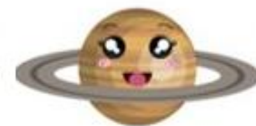
4:30-5 mins: Smashing Saturn