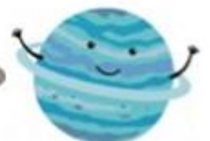
5+ mins: Ultra Uranus