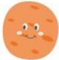
2-2:30 mins: Mighty Mercury