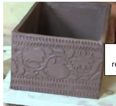
A slab rolled pot