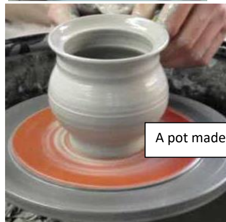
A pot made on a wheel