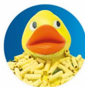
Quack & Cheese