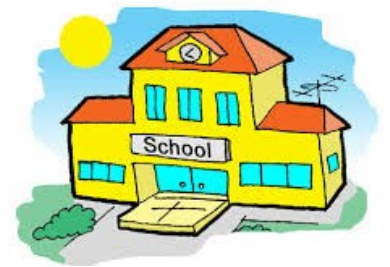
Not the actual building!

In the coming weeks the building contractor will be putting on a public consultation event, hosted by the school where parents and other members of the community will be able to look at and comment on the plans. We will be publicising this date shortly.