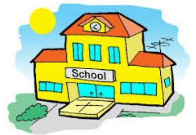
Not the actual building!

In the coming weeks the building contractor will be putting on a public consultation event, hosted by the school where parents and other members of the community will be able to look at and comment on the plans. We will be publicising this date shortly.