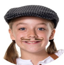
Centepede from James and the Giant Peach