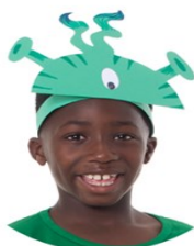
Aliens Love Underpants