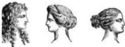
Some ideas for Ancient Greek hairstyles.