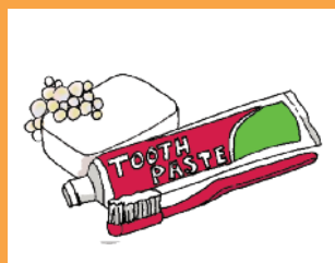
Healthcare products £1.70