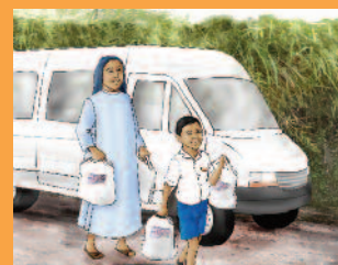
Whole packs for 400 children £1,600

97% of money raised for Mission Together goes towards Mission Together's work to support children!