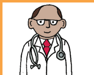
A doctor's or dentist's clinic £30