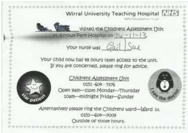
Appointment or attendance certificate.

Absence, due to illness over 3 days must be authorised on the production of medical evidence from your doctor such as a stamped appointment card, tear off from prescription or other evidence. Parents should never incur a charge for this. We do not ask for a letter from your doctor as this may be chargeable depending upon each surgery.