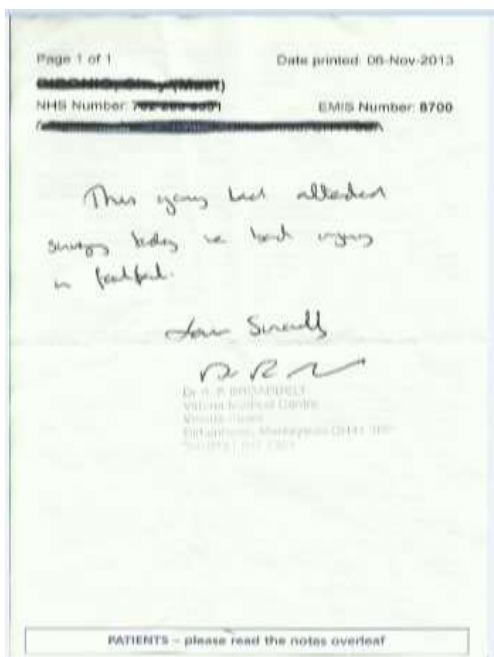
Tear off from your child's prescription.