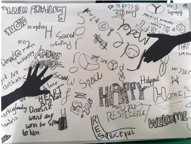
Artwork offering help, showing feeling and emotions.