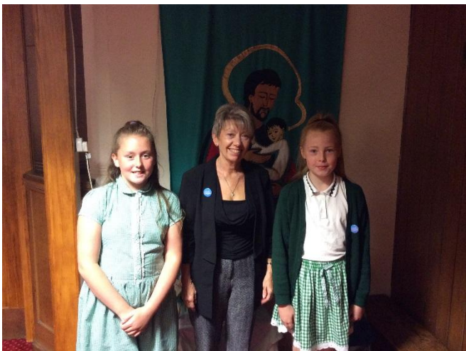
The children presented our head of Governors and our Priest with badges, asking them to be School of Sanctuary Ambassadors for our school.