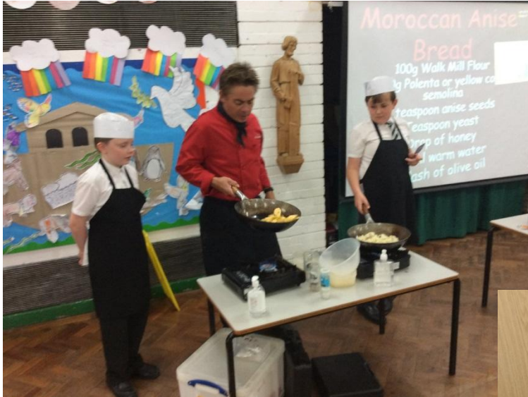
Cooking food from other cultures.

Paddington Bear came to seek sanctuary in Foundation Stage.