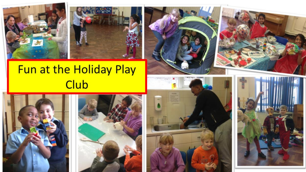
Fun at the Holiday Play Club