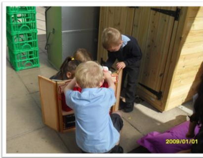
Year 1 outside learning area