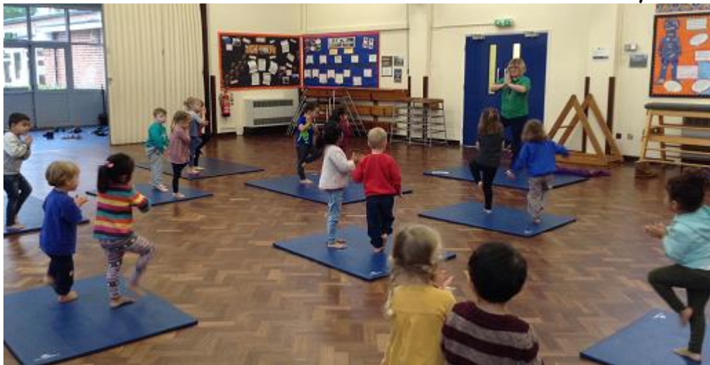
The school Hall

If there is anything else you want to know please ask us.