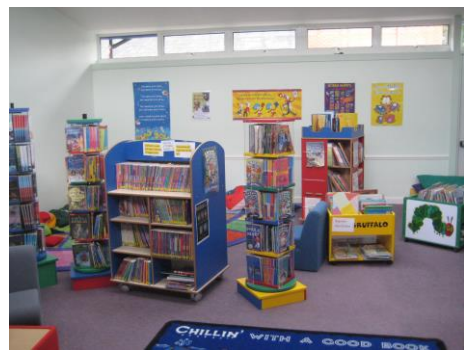
The school library