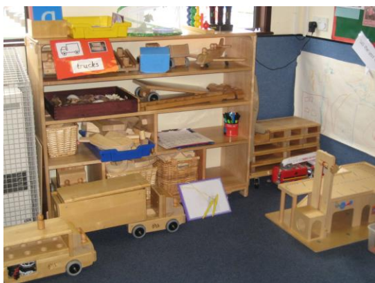
Trucks and bricks