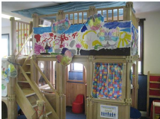
House and Loft

When you are choosing where to play (explore time) you can go into these areas too: