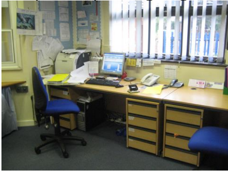
The school office