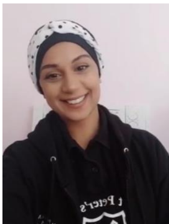
Miss Yad Nursery Nurse