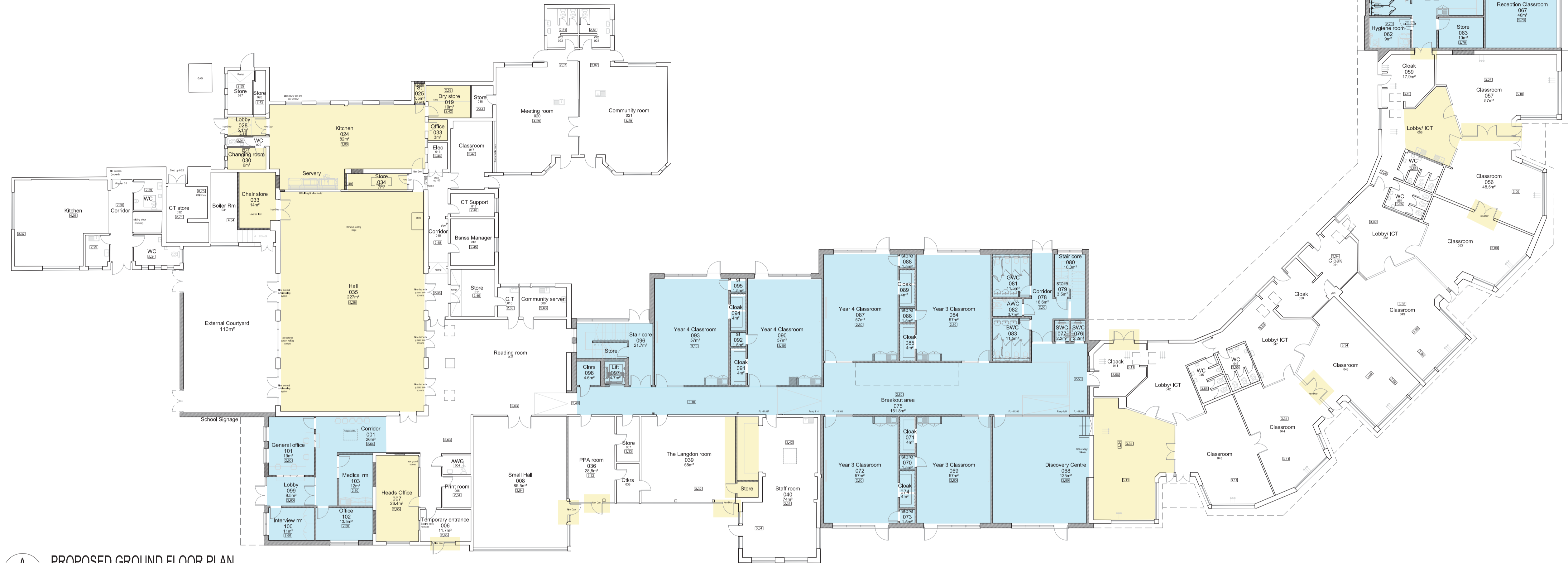
A PROPOSED GROUND FLOOR PLAN A4210 1:200