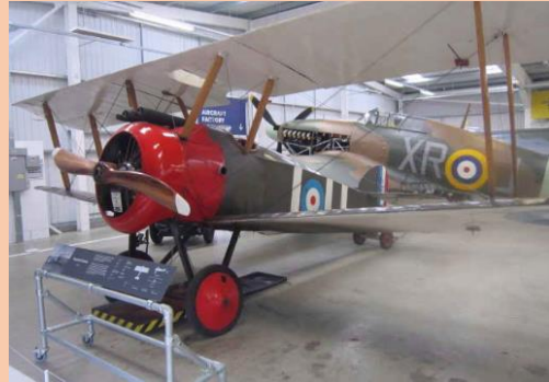
Brooklands Motor Museum