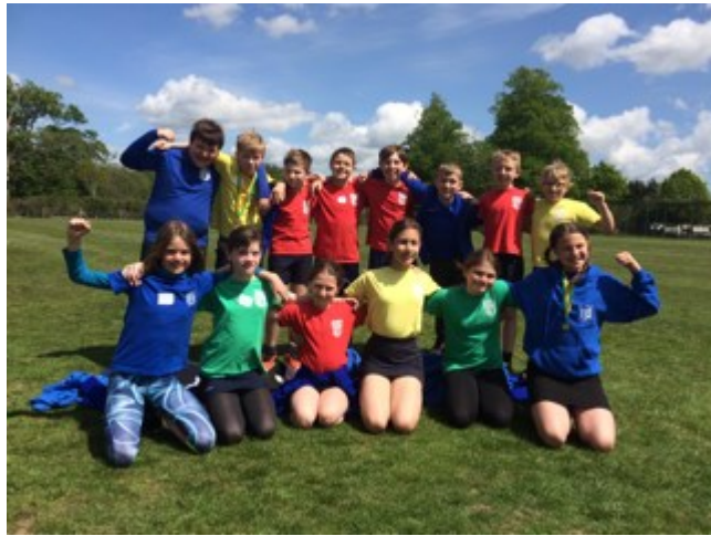
Year 6 children at Oakwood mini- Olympics.