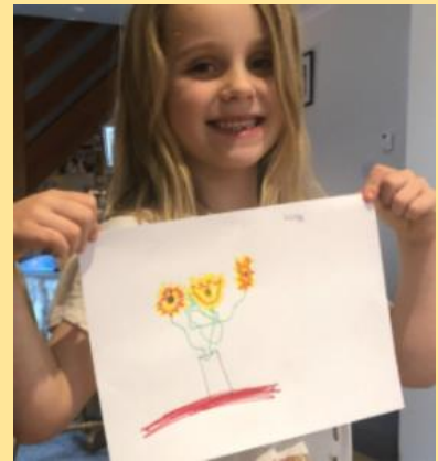
Luna's super sunflower