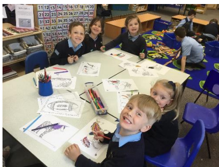
After School Pot Luck Club