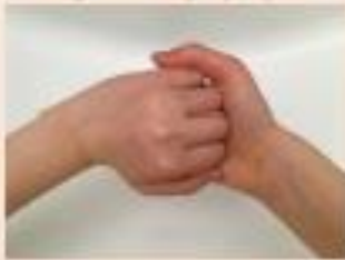
4. backs of fingers