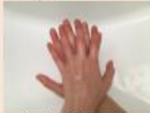
2. back of hands