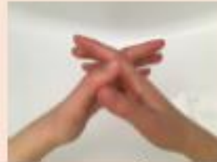
3. between fingers