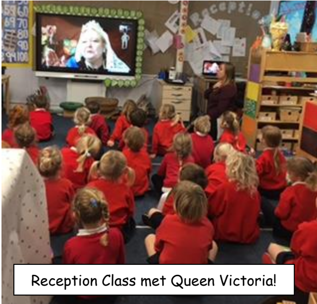
Reception Class met Queen Victoria!