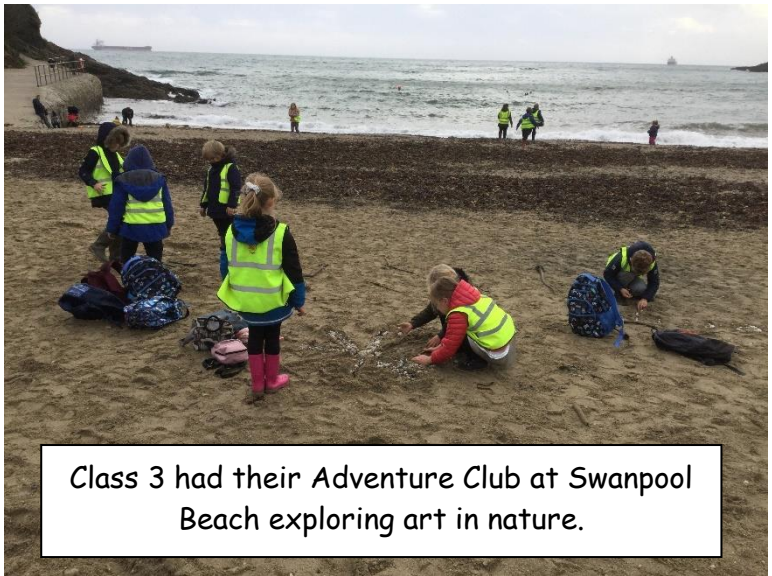
Class 3 had their Adventure Club at Swanpool Beach exploring art in nature.