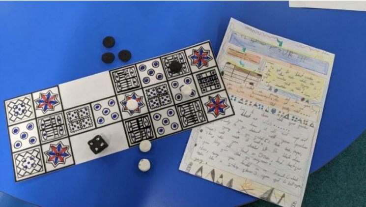
Class 4 have created a Royal Game of Ur based upon an ancient game discovered in Mesopotamia.