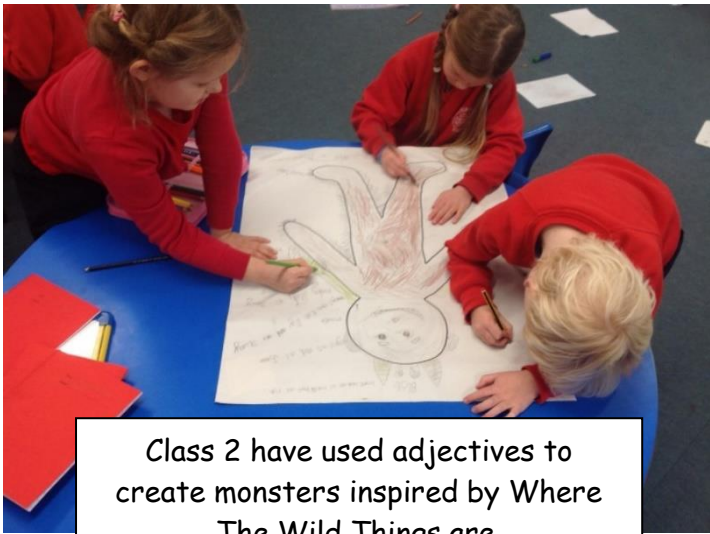
Class 2 have used adjectives to create monsters inspired by Where The Wild Things are.