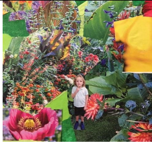
Class 1 have been making their own collages inspired by Alice in Wonderland.