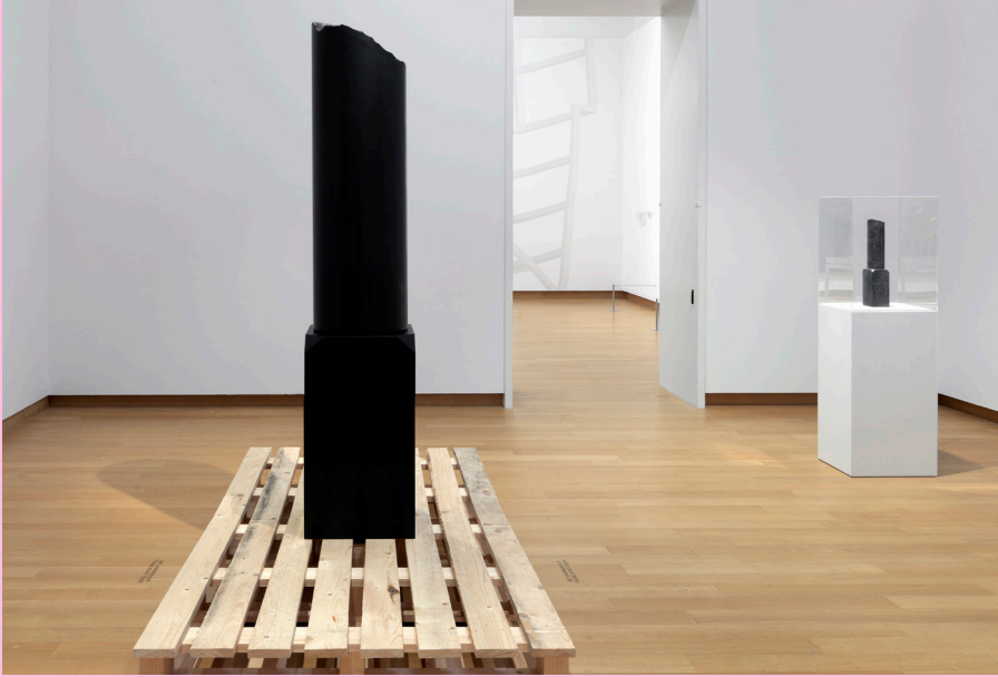
Steve McQueen, Broken Column, 2014.