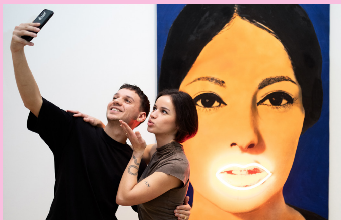
Martial Raysse, Peinture à haute tension , 1965.