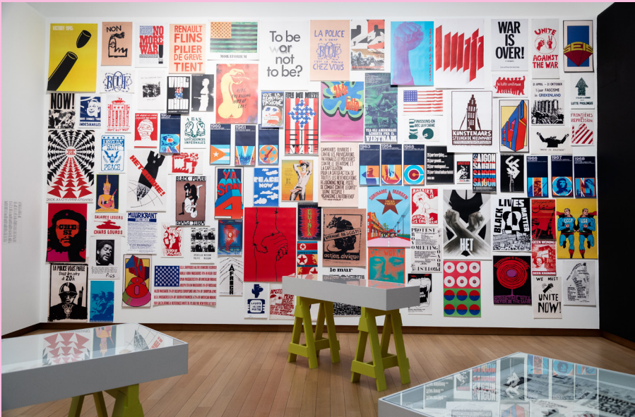
Protest and revolution wall.