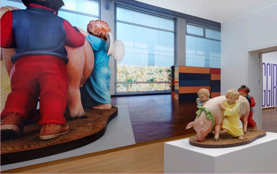
Zaaloophname Tomorrow is a Different Day. Collectie 1980–Nu.