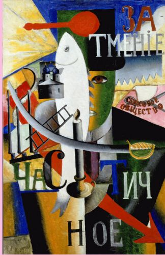
Kazimir Malevich, An Englishman in Moscow , 1914.