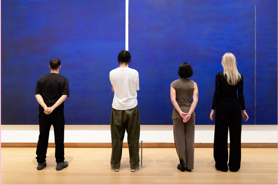
Barnett Newman, Cathedra, 1951.