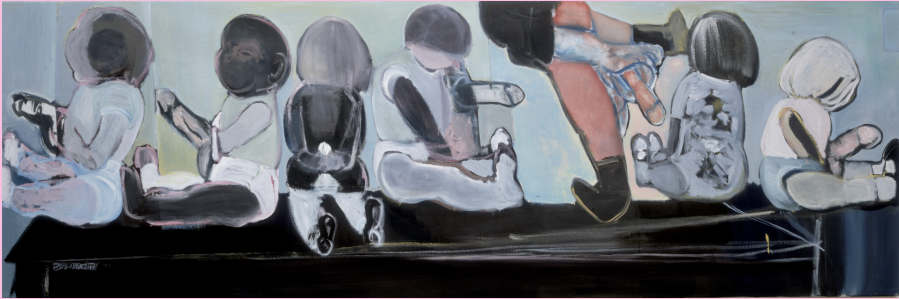
Marlene Dumas, Big Artists , 1991.