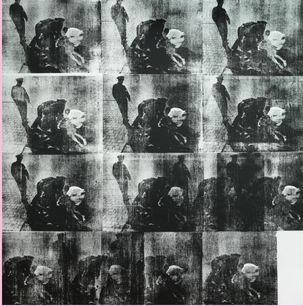
Andy Warhol, Bellevue II , 1963.