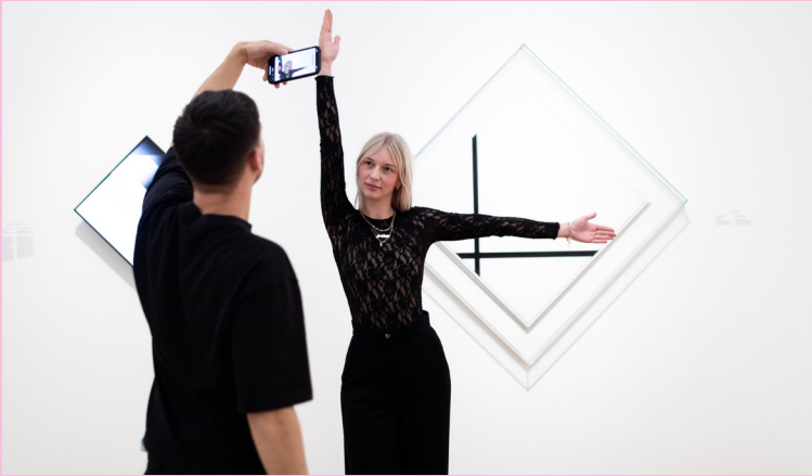
Piet Mondrian, Lozenge Composition with Two Lines , 1931.