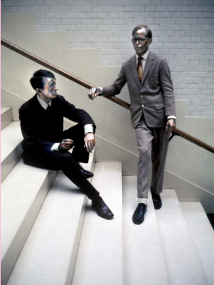
Gilbert & George: Living Sculpture, 1969