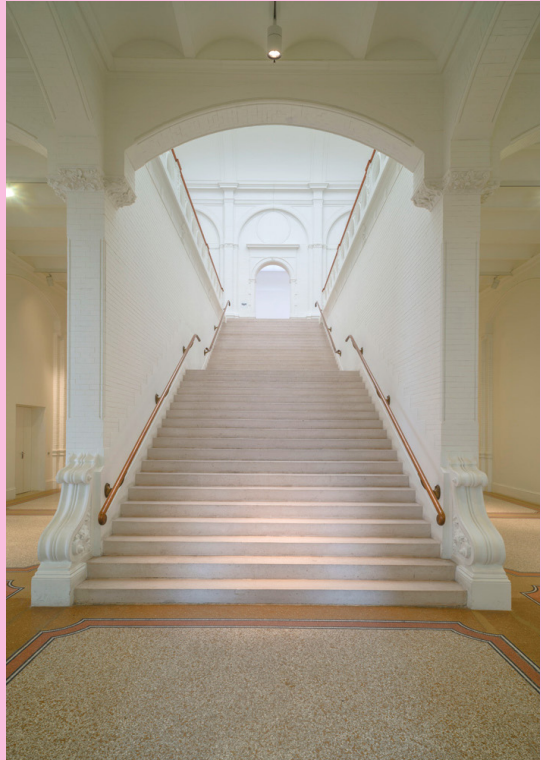
Monumental staircase.

The staircase has become an iconic spot in the museum. Rumour has it that this is the best spot in the museum to pose for photos. Artist duo Gilbert & George were ahead of this in 1969 by posing as a 'living statue' for five hours. They painted their faces and hands bronze and didn't move at all!