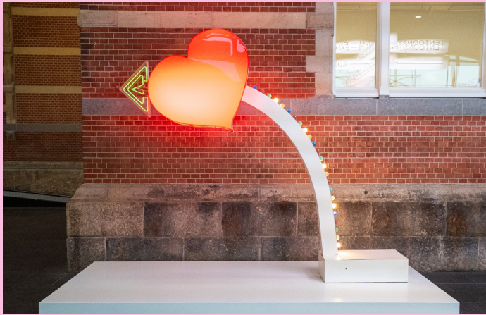
Martial Raysse, Encore un instant de bonheur (sculpture moderne), 1965