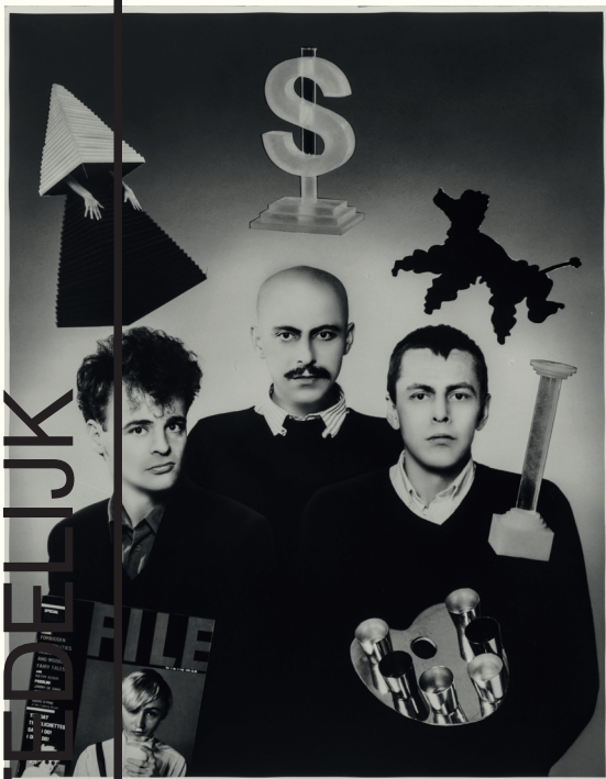
General Idea, Self-portrait with Objects , 1981–82, Collection National Gallery of Canada. © General Idea.

The Canadian artists Felix Partz (1945–1994), Jorge Zontal (1944–1994) and AA Bronson (b. 1946) were active as General Idea from 1969 to 1994. Witty and eccentric, General Idea tells the story of a group whose brilliant output not only resonated in their own time, but also laid the foundation for future generations of creators, informing new ways of reimagining our world through art. Addressing various aspects of mass media,