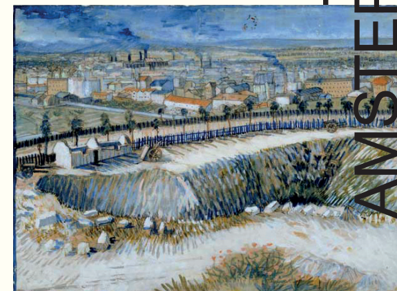
Vincent van Gogh, Outskirts of Paris, View from Montmartre , 1887, collection Stedelijk Museum Amsterdam, donation VVHK, 1949