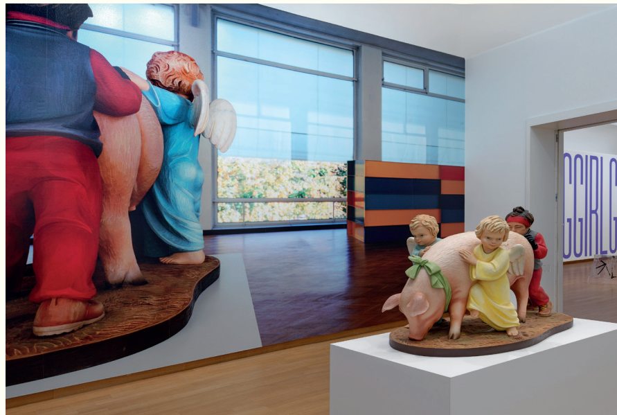
Gallery view Tomorrow is a Different Day .

In the large IMC gallery on the first floor, also known as the Gallery of Honor, Özgür Kar (1992) reflects on the contemporary human condition, focusing on the input we receive from mass- and social media, and how these sources influence our sense of self. This is the first solo presentation of Kar's work in an institutional context in the Netherlands.