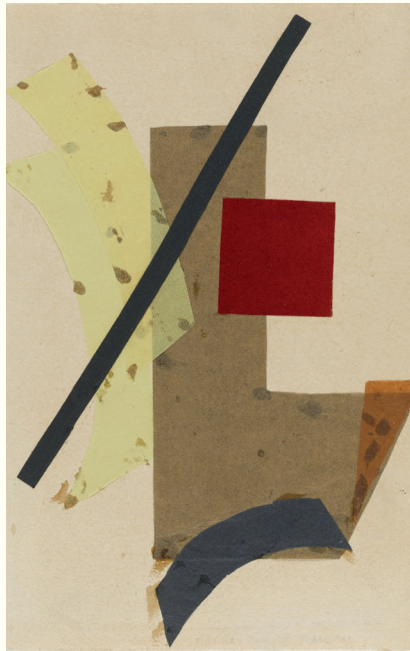
Olga Vladimirovna Rozanova, Abstract composition , 1915, collage: work on paper. Stedelijk Museum Amsterdam, loan of the Khardzhiev Foundation, 2001

This presentation pays extra attention to female makers and mediators.