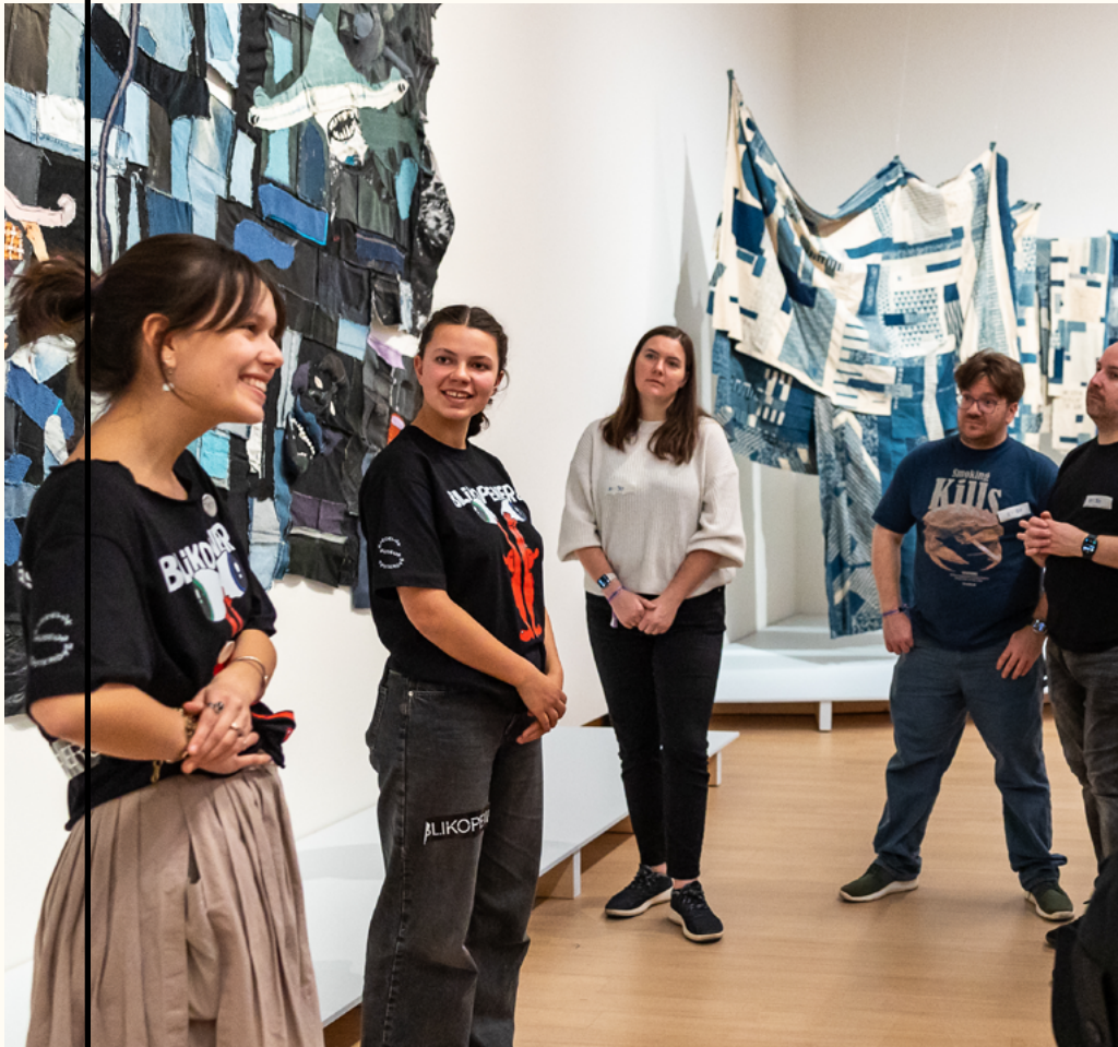
Blikopeners giving an accelerated tour of the Stedelijk on Museum Night, 2024