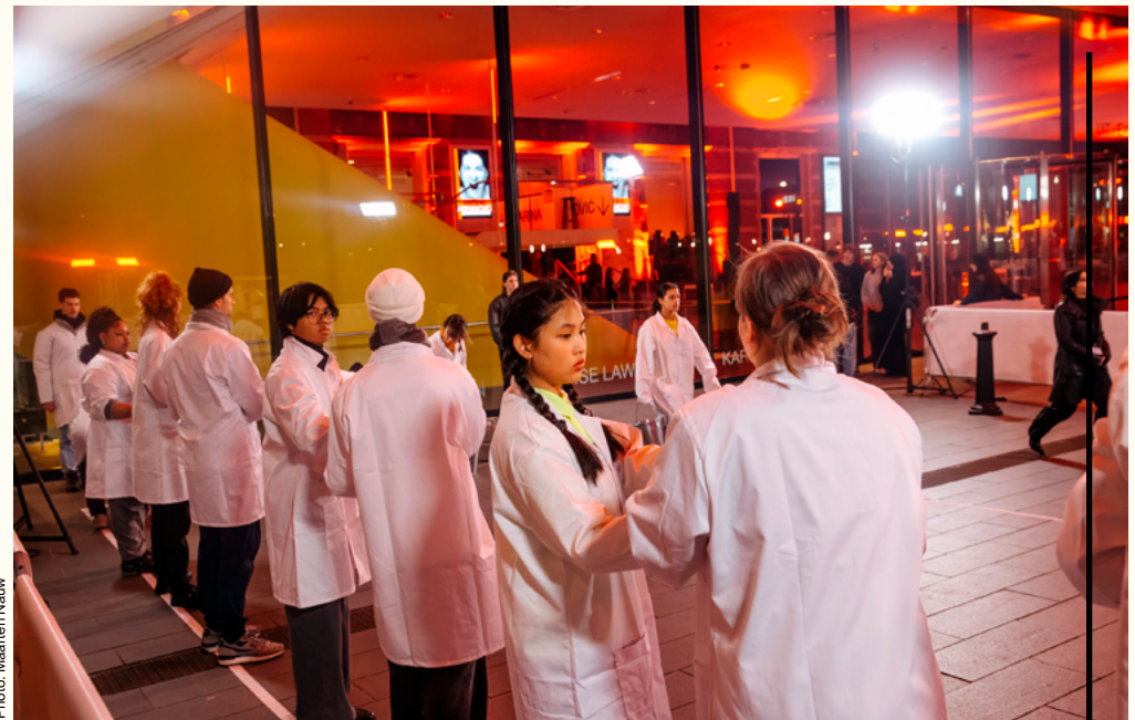
Blikopeners performing at the opening of the Marina Abramović exhibition

It's hard to say with absolute certainty whether this stems directly from their participation in the Blikopeners program and how this led to their current pursuits. However, participation in the program certainly developed the participants' ability to express themselves freely and have the confidence to do so. In addition, former Blikopeners credited the diversity of their group for their continued willingness to verbalize their commitment to providing opportunities to those who would otherwise be denied them. Thus, it is reasonable to suppose the program at least contributed to their current efforts.