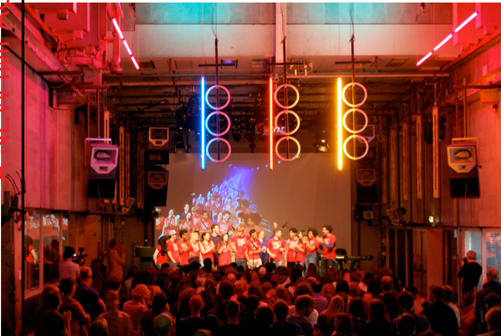
A Blikopener event at Club Trouw in 2011

The Blikopeners was a novelty when it began, and was thus something of a pilot project. Since then, youth programs and peer education have become increasingly commonplace in the Dutch museum sector and beyond. Our findings show the impact of the program to be far-reaching and reveal the elements responsible for this. In many cases, the study confirmed what we already suspected was key to the success of programs such as this. It's with great pleasure that we now share the following recommendations with our colleagues in the cultural sector.