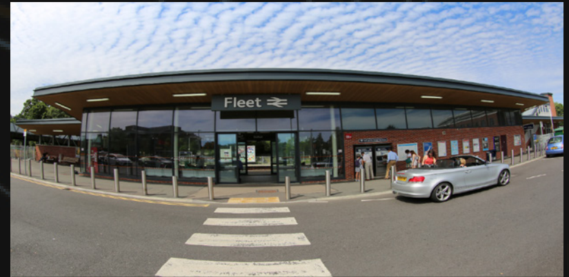
Fleet Mainline Railway Station