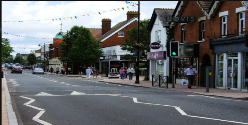
Fleet High Street