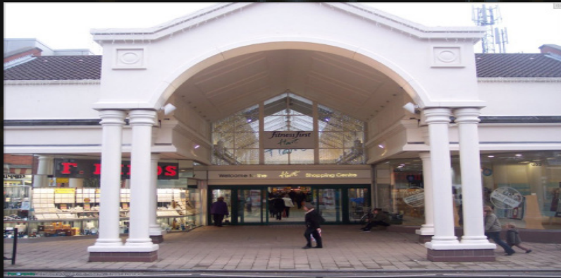
Hart Shopping Centre

The villages of Hartley Wintney and Odiham plus the attractive market town of Farnham are all within a six mile drive.