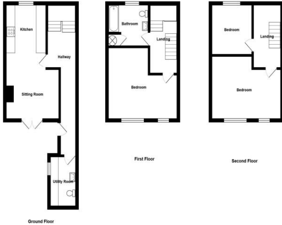
The position and size of Doors, Windows and All Features, are approximate and for display purposes only All Measurements are Approximate