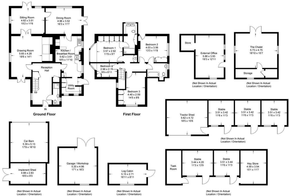
Illustration for identification purposes only, measurements are approximate, not to scale. © focuspropertysolutions.co.uk 2017 Produced for Guy Leonard & Co