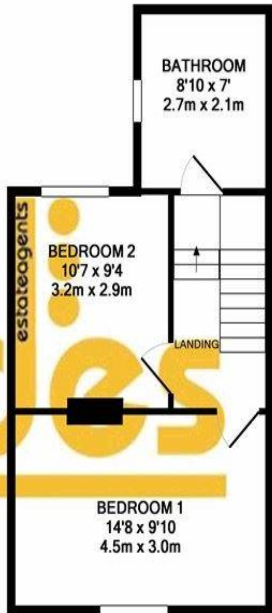
1ST FLOOR APPROX. FLOOR AREA 372 SQ.FT. (34.6 SQ.M.)