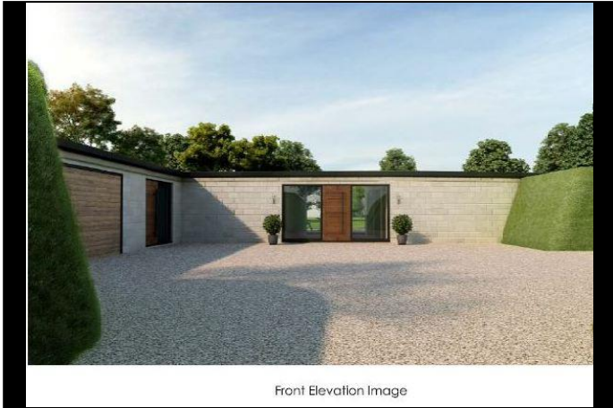
Front Elevation Image