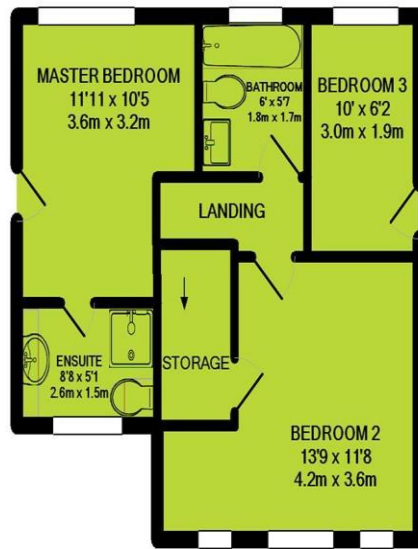
1ST FLOOR APPROX. FLOOR AREA 461 SQ.FT. (42.9 SQ.M.)

TOTAL APPROX. FLOOR AREA 1001 SQ.FT. (93.0 SQ.M.)